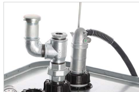
Assembly set shown here on the left, for the connection of e.g. vent valve, plus overflow protection or limit switch, Order no. 309460