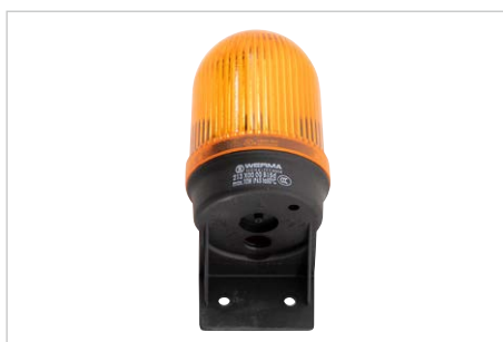
optical warning device (rotating beacon), Order no. 309459