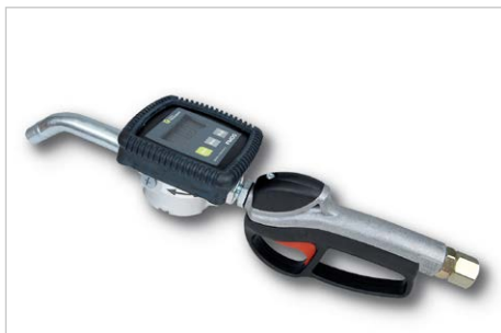
Manual flow meter for engine oil, Order no. 309465