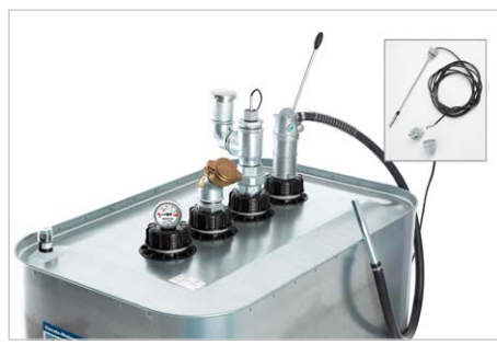
Storage and disposal tank with fill point, pump, optionally available as a manual or electric pump, assembly set, vent fitting and limit value sensor.