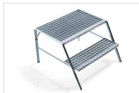
Decanting step, Order no. 117782