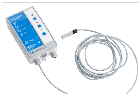
Electrical leak warning device, for visual and acoustic notification of liquid accumulations, Order no. 309468