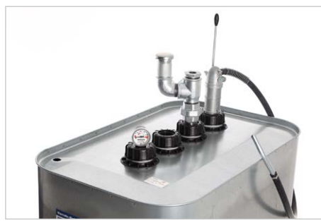
Storage and disposal tank with installation kit and pump, available as manual or electric pump.