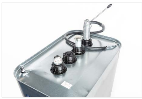
Storage and disposal tank with vent fitting and pump, optionally available as a manual or electric pump.