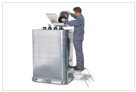
Storage and disposal tank with filling funnel and 2-stage step for manual filling and collection of residual liquids.