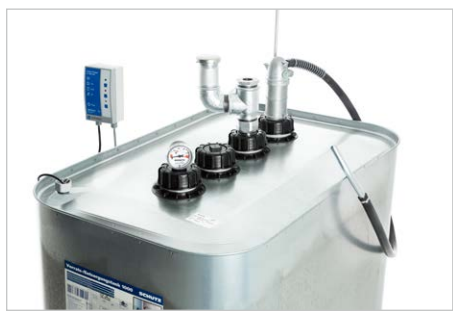
Storage and disposal tank with pump, optionally available as manual or electric pump, installation kit, vent fitting and electrical leak warning device.