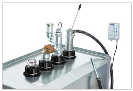
Storage and disposal tank with fill point, pump, optionally available as a manual or electric pump, assembly set, vent fitting and electrical overfill protection.