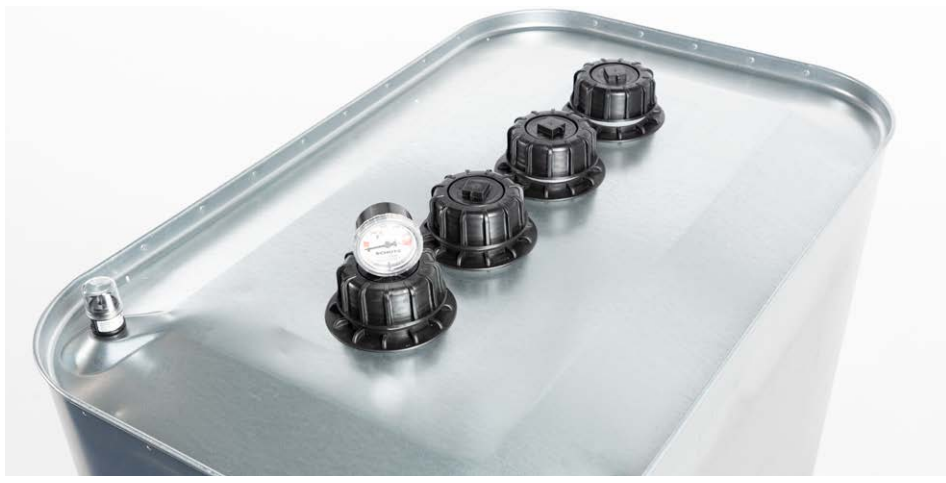
Storage and disposal tank with fill level indicator and visual leak indicator. Double-walled tank with inner container made of plastic (PE) and outer container made of steel as a drip tray. Suitable as a storage tank, with DIBt approval and as a transport container with UN approval 31HA1/Y/.../D/.../BAM...