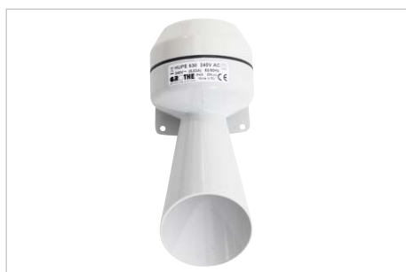
Acoustic warning device (horn), Order no. 309458