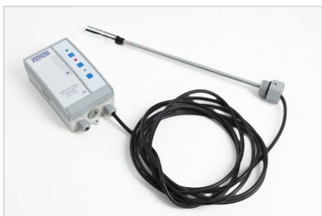
Electrical overflow protection, Order no. 309466